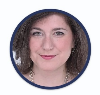
Innovation Design Strategist | Allstate Author of "Life & Death Design"